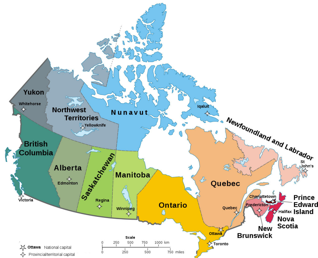
Political map of Canada (modified) unknown author from Wikimedia Commons, CC-BY-SA

Canada is composed of 10 provinces and three territories that are divided into five regions: