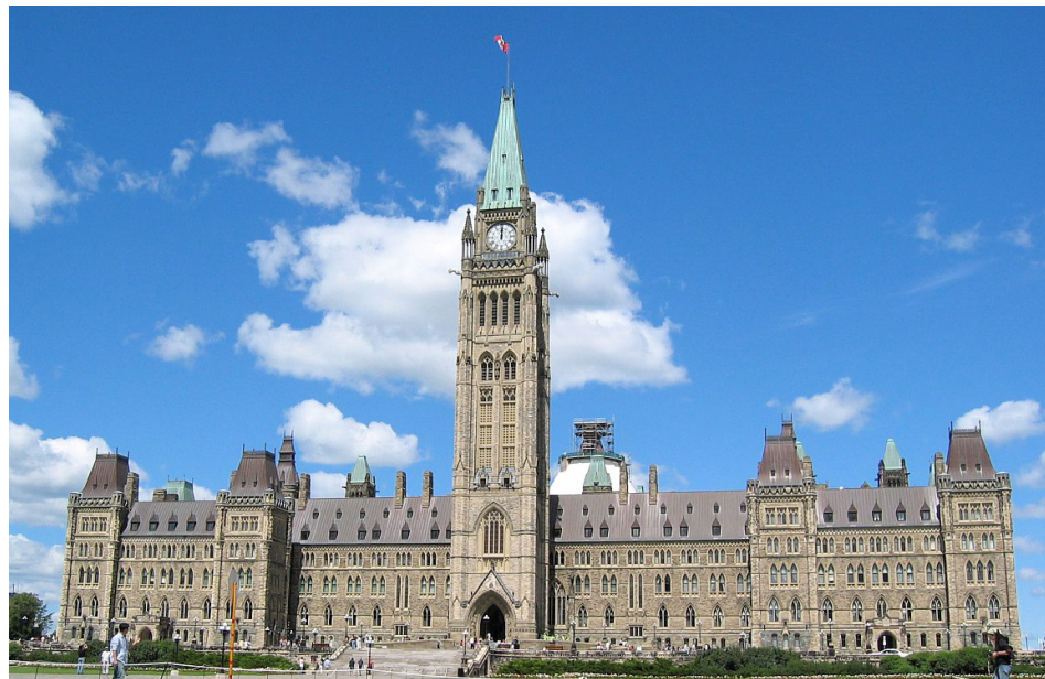
Parliament - Ottawa

Canada is proud of upholding the oldest continuous constitutional tradition in the world. Its form of government is a constitutional monarchy where the reigning British monarch (His Majesty King Charles III) is the head of state, while the Prime Minister is the head of government. The King does not directly rule. He is represented by the governor general at the federal level, and