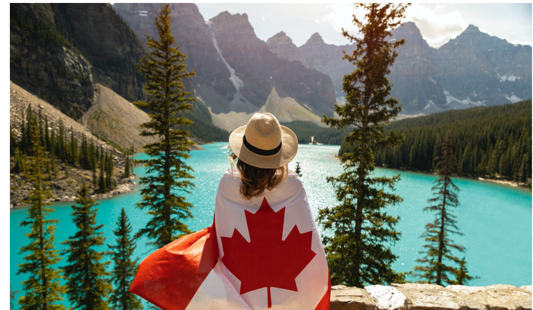
Woman draped in flag of Canada

Aside from majestic scenery, maple syrup, and hockey, the country is known for its diversity and most especially for its kind and welcoming people.