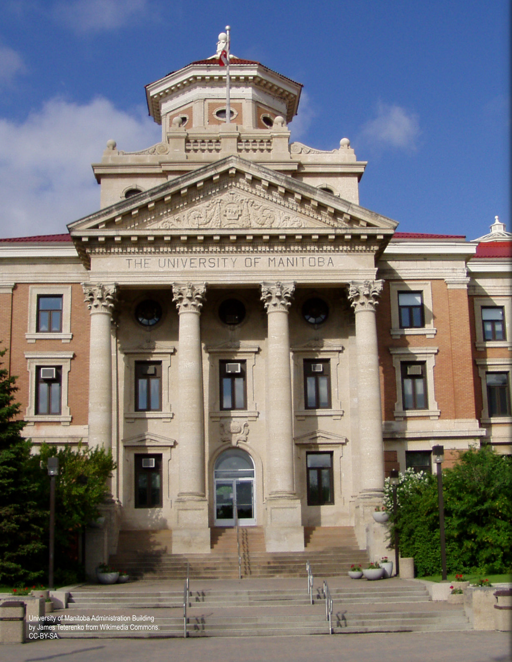
University of Manitoba Administration Building