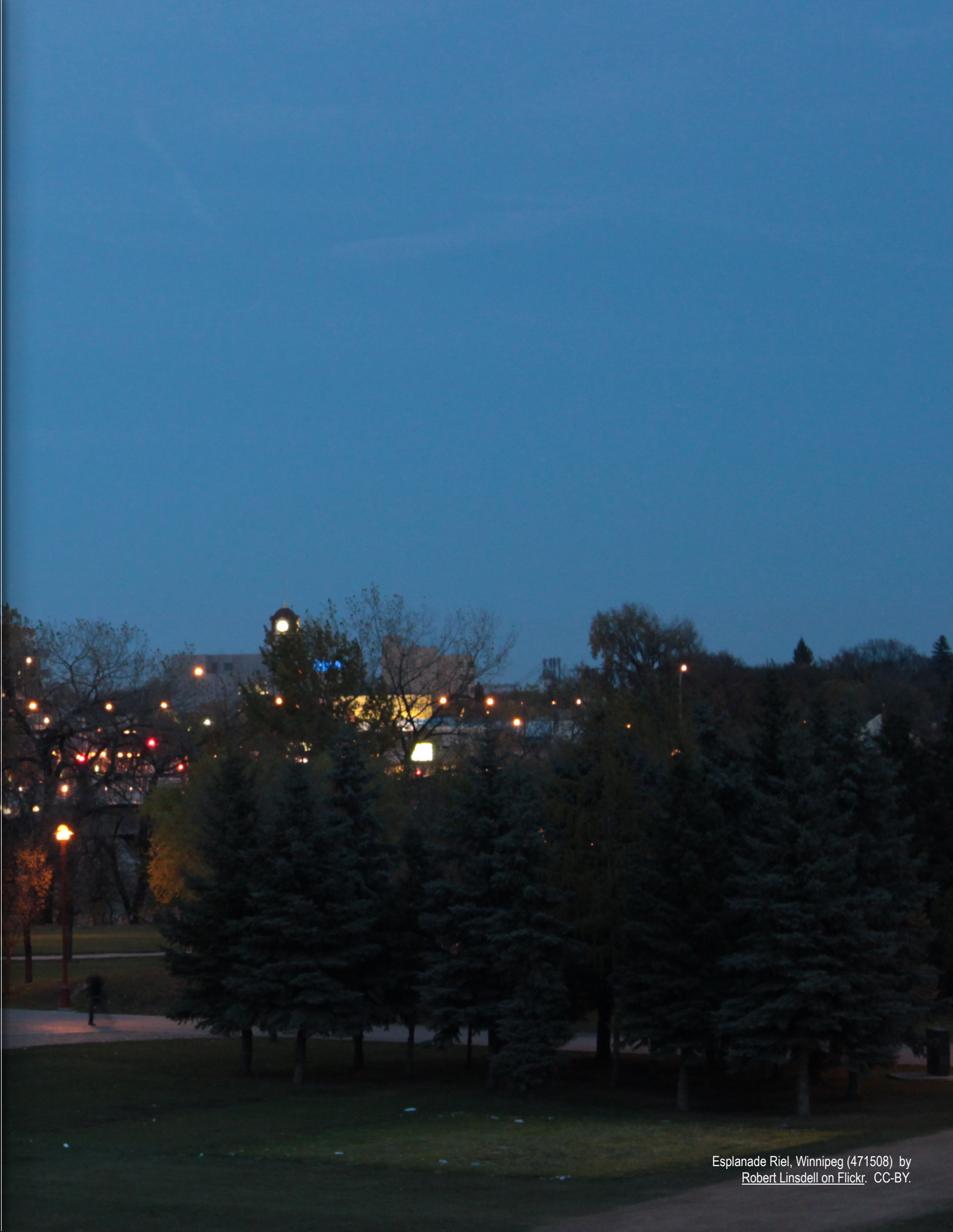
Esplanade Riel, Winnipeg (471508)