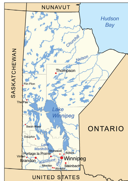
Manitoba general map by Kmusser

This diverse province is located in heart of the country bordered by Saskatchewan to the west, Ontario to the east, Nunavut Territory to the North, and the US states of North Dakota, and Minnesota to the south. It has a varied landscape of lakes and rivers, mountains, forests, and prairies that covers 649,950 square kilometres. That's twice the size of the United Kingdom!