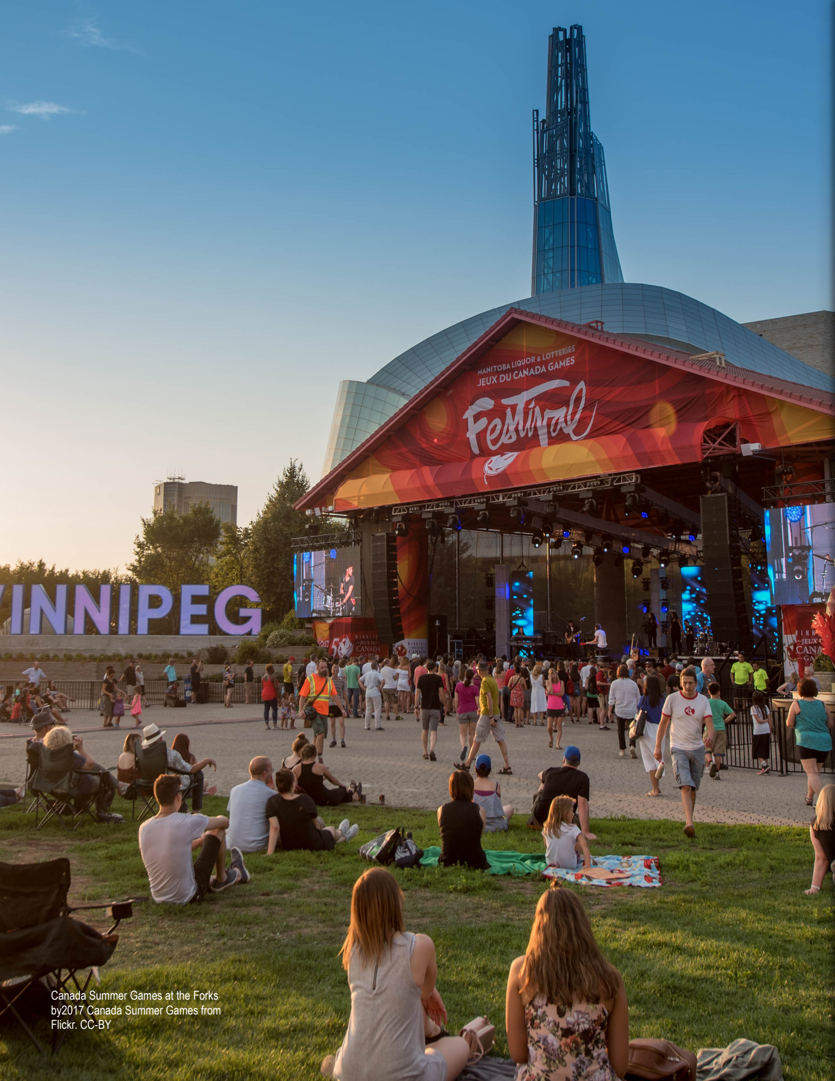
Canada Summer Games at the Forks

activities are held all year round. In fact, Folklorama, the world’s largest and longest-running multicultural festival, is held every summer here. Meanwhile, Festival du Voyageur, Canada’s largest winter festival is held in February. It’s a fun way to go back in time as the festival showcases French Canadian, Metis, and First Nations histories. Winnipeg is also home to the Canadian Museum for Human Rights, the world’s first museum dedicated to the “evolution, celebration, and future of human rights.”