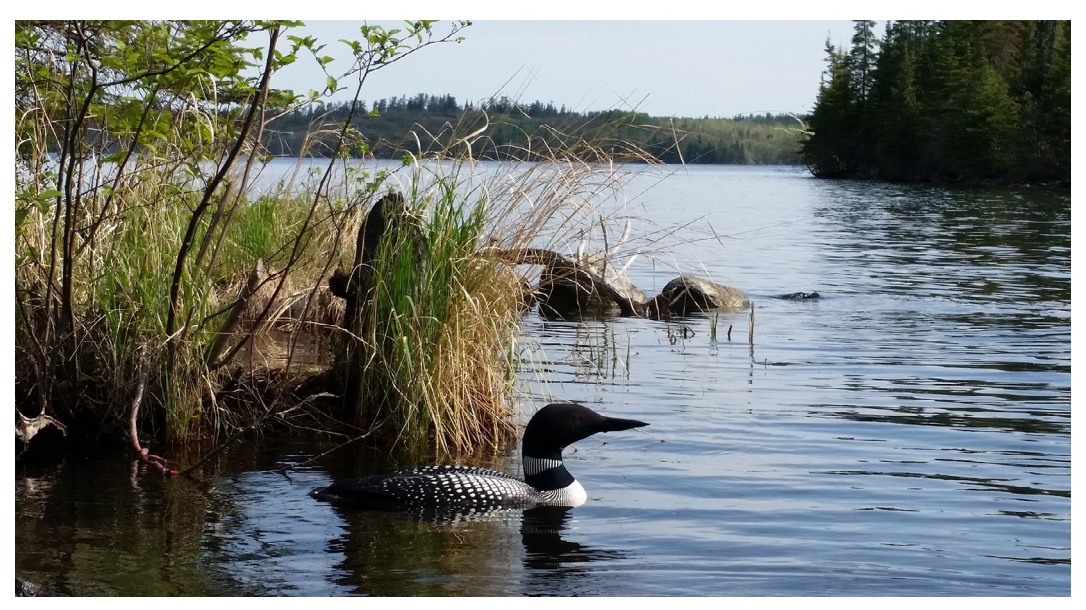
Canada loon at Falcon Lake, Manitoba

This land spreads over parts of the traditional territories of the Assiniboine, Dakota, Cree, Dene, Anishinaabeg, and Oji-Cree peoples, and on the homeland of the Métis nation. The province's name, "Manitoba" was derived from "Man-intowahpaow", which is Cree for the narrows of the Great Spirit .