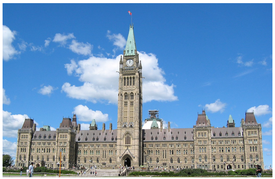
Parliament - Ottawa

Canada is proud of upholding the oldest continuous constitutional tradition in the world. Its form of government is constitutional monarchy where the Queen is the head of state, while the Prime Minister is the head of government. The Queen does not directly rule. She is represented by the governor general at the federal level, and by lieutenant governors in the provinces.