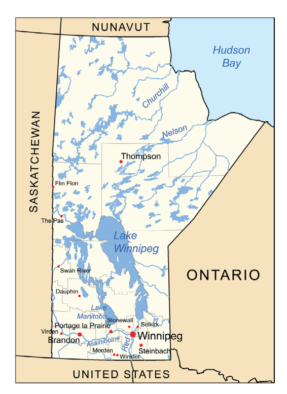
<u>Manitoba general map</u> by Kmusser from Wikimedia Commons. CC-BY-SA

This diverse province is located in heart of the country bordered by Saskatchewan to the west, Ontario to the east, Nunavut Territory to the North, and the US states of North Dakota, and Minnesota to the south. It has a varied landscape of lakes and rivers, mountains, forests, and prairies that covers 649,950 square kilometres. That's twice the size of the United Kingdom!