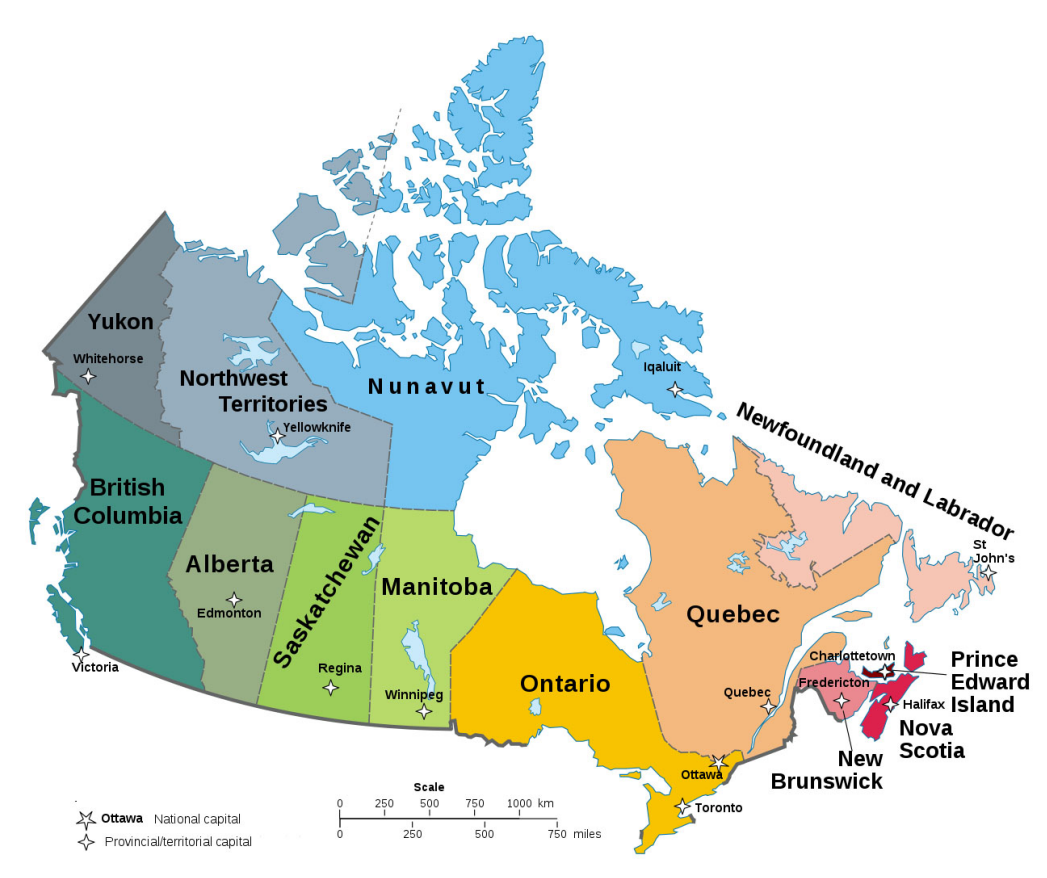
Political map of Canada (modified)

Canada is composed of 10 provinces and three territories that are divided into five regions: