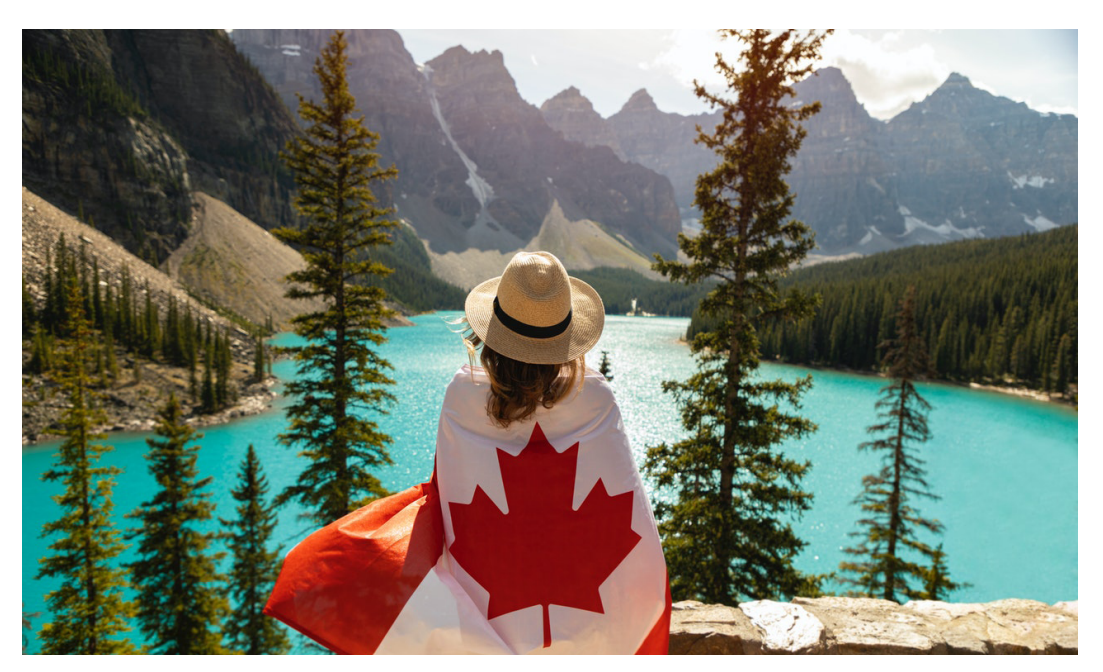
Woman draped in flag of Canada

Aside from majestic scenery, maple syrup, and hockey, the country is known for its diversity and most especially for its kind and welcoming people.